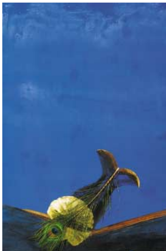
“Los Amantes de Sumpa, el amor desenterrado;” an extract from the exhibition by Nelson Román

The Exhibition is open from 9-5 at WIPO headquarters Geneva, from March 22 to April 2, 1999.